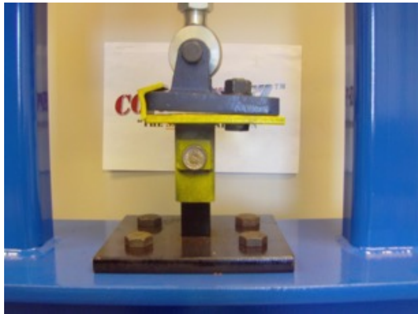
Figure 4: Dayton Superior 12 K Shoe; 0.375 Plate, 0.25 Angle;