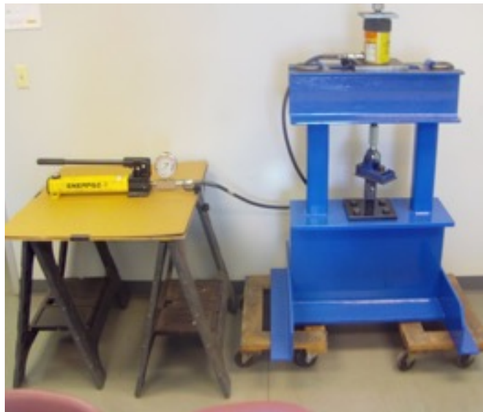
Figure 1 & 2: CONNECT-EZ H-B Test Stand; 27 February, 2015