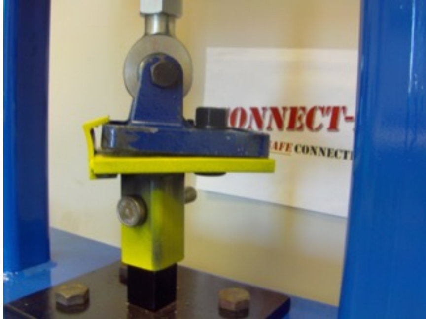
Figure 5: Dayton Superior 12 K Shoe; 0.50 Plate, 0.25 Angle;